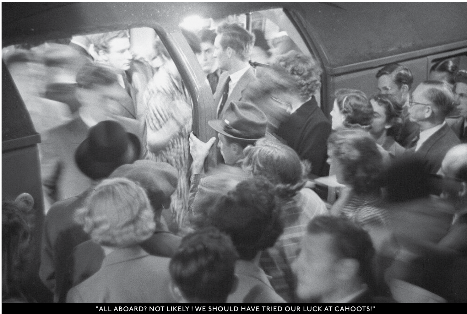
"ALL ABOARD? NOT LIKELY! WE SHOULD HAVE TRIED OUR LUCK AT CAHOOTS!"