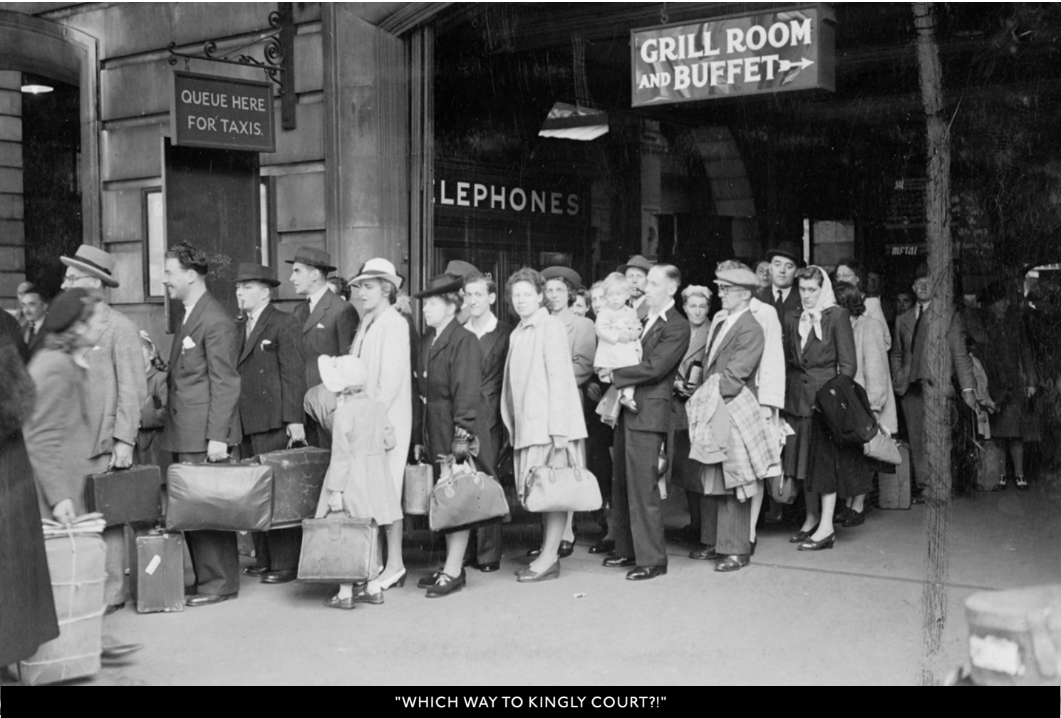
"WHICH WAY TO KINGLY COURT?!"