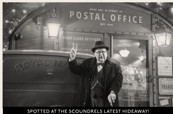
SPOTTED AT THE SCOUNDRELS LATEST HIDEAWAY!

The Scoundrels' secret is out, as the Cahoots network expands with the unveiling of Cahoots Postal Office in Borough Yards, London's newest spot for secret tipples hidden in a former post office. Modelled after a 1940s mail depot commandeered by 'The Scoundrels', it promises spiffing new cocktails and high spirits in full swing. Guests enter through an innocuous 'Post Office' desk, pass the Scoundrels' lookout, and activate a secret door leading to a hidden cocktail bar set up within a network of tunnels, underneath the famous railway arches. With a pneumatic tube delivering cocktails and seating ranging from cosy booths to repurposed mail sacks, Cahoots Postal Office is set to become Borough's hottest illicit hideaway!