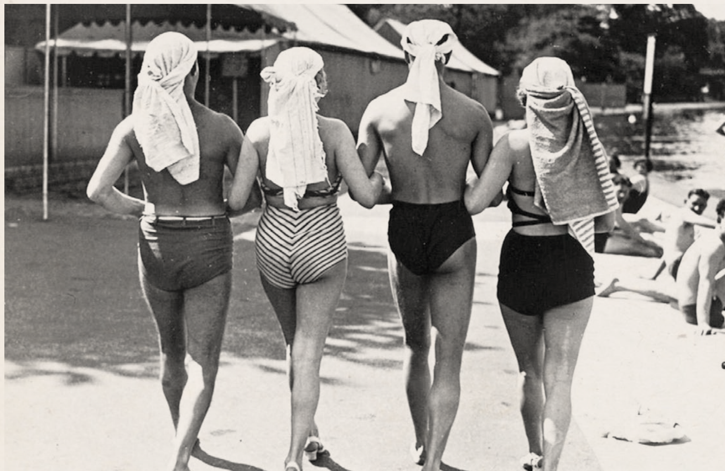
SCOUNDRELS STRUT TO THE TICKET HALL AFTER A QUICK DIP AT THE LIDO!