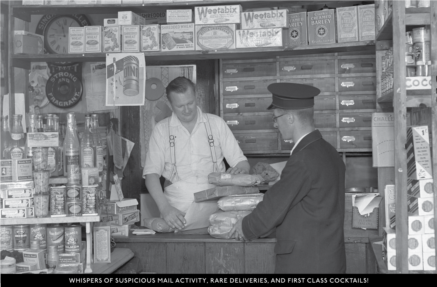
WHISPERS OF SUSPICIOUS MAIL ACTIVITY, RARE DELIVERIES, AND FIRST CLASS COCKTAILS!