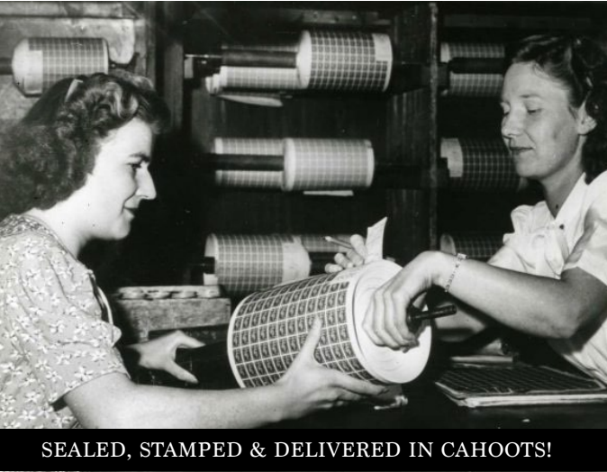
SEALED, STAMPED & DELIVERED IN CAHOOTS!

Scoundreljito HERBAL / REFRESHING ..... £15 Bacardi Caribbean Spiced rum, shiso, tarragon & mint cordial, topped up with Franklin & Sons Soda Water