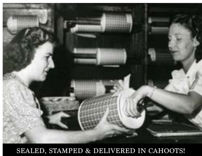
SEALED, STAMPED & DELIVERED IN CAHOOTS!

Bacardi Caribbean Spiced rum, shiso; tarragon & mint cordial, Franklin & Sons 1886 Soda Water