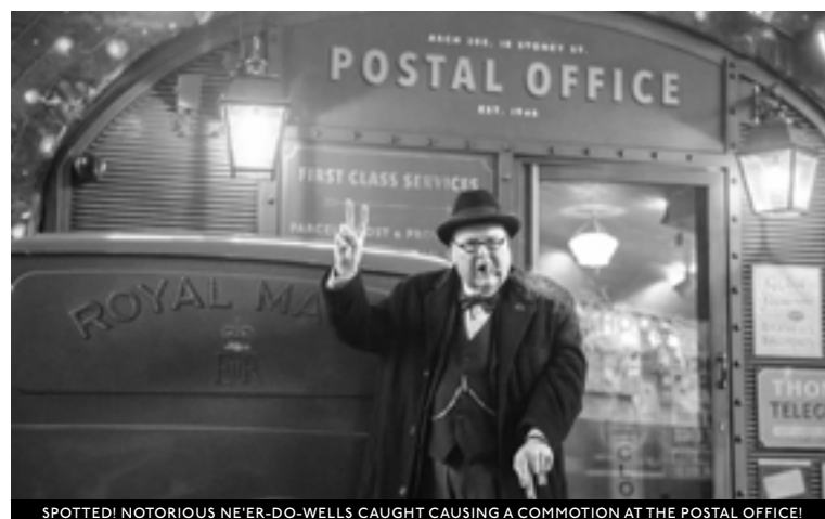
SPOTTED! NOTORIOUS NE'ER-DO-WELLS CAUGHT CAUSING A COMMOTION AT THE POSTAL OFFICE!

NON-ALCOHOLIC OPTION 60 kcal ..... £13 Smiling Wolf Non-Alcoholic Functional Dry Gin, apple, pear, ginger, elderflower and citrus essence