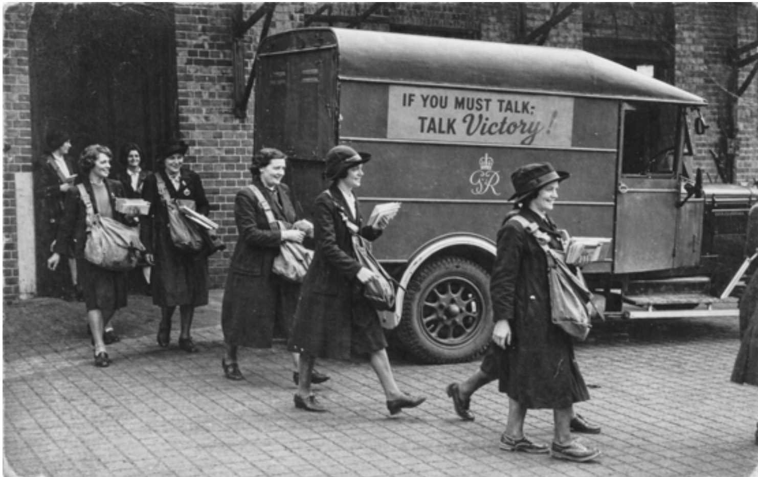
POSTAL WORKERS DEPART THE DEPOT FOR THE DAY'S DELIVERIES, WITH PLANS FOR LATER QUIETLY IMPLIED.